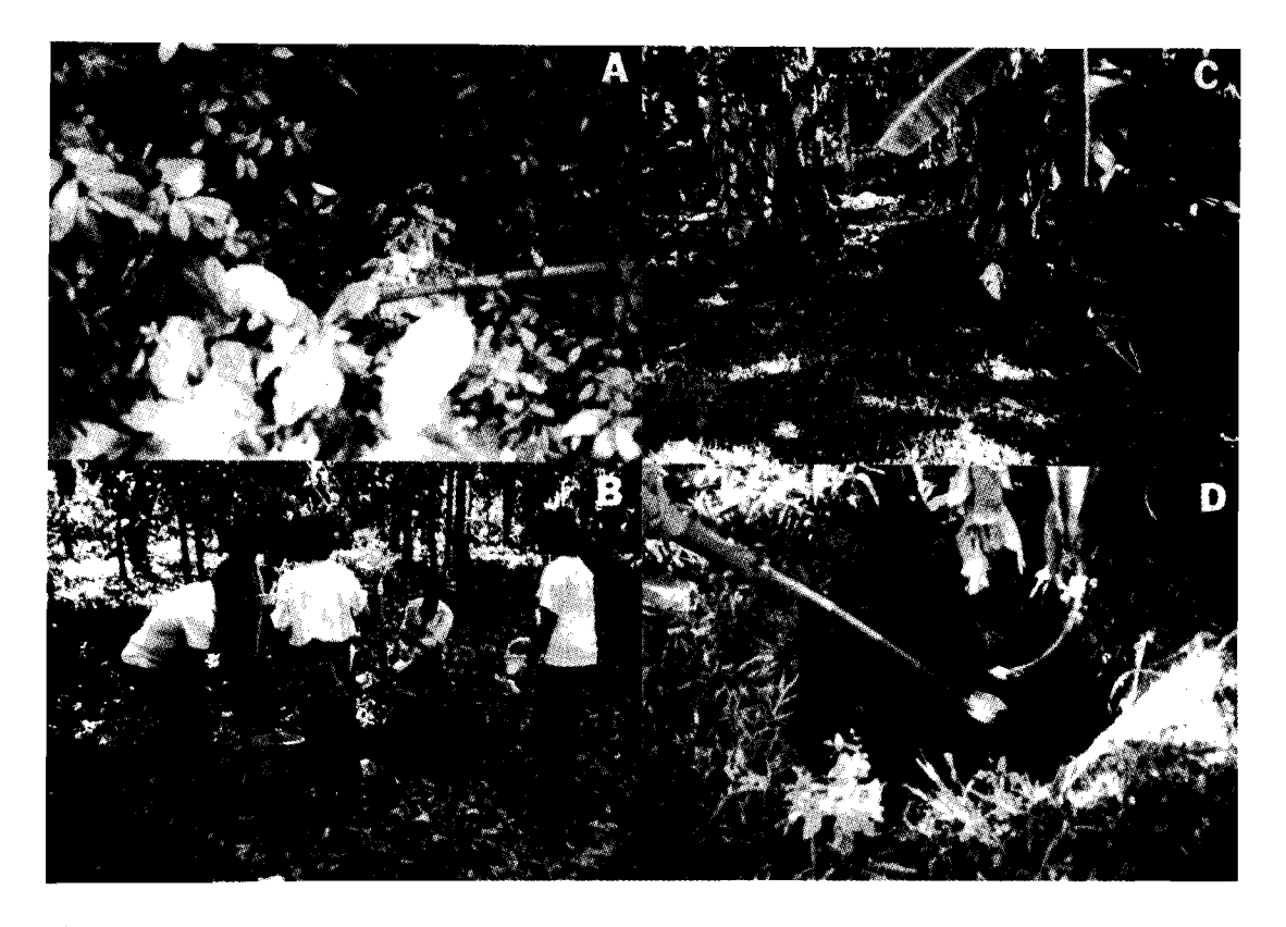
Fig 2—(A) Old, shaded pit under dense vegetation; (B) concrete-lined well in open area under shade trees; (C) exposed pit under full shade; (D) close up of same pit shown in (C) when partially shaded.

were small, clear, shaded pools in clay soil (Colless, 1957; Scanlon and Sandhinand, 1965). At our study site, An. dirus larvae were found in gem pits containing underground water or rainwater under varying degrees of shade. The largest number of An. dirus pupae were collected from June to October (Table 6). The marked reduction in numbers from November to April may have been caused by both the habitat drying up and the habitat becoming less suitable. However, during the dry season some reproduction was maintained in the heavily shaded, undisturbed pools which were hidden under vegetation. When the rains returned, An. dirus reappeared in most of the study pits. Toward the end of the rainy season, we collected humid soil from a suspected oviposition site (ie, from pit M) and returned it to the laboratory. First instar An. dirus larvae hatched from this artificially flooded soil sample indicating that the eggs of An. dirus can tolerate some drying. We observed that