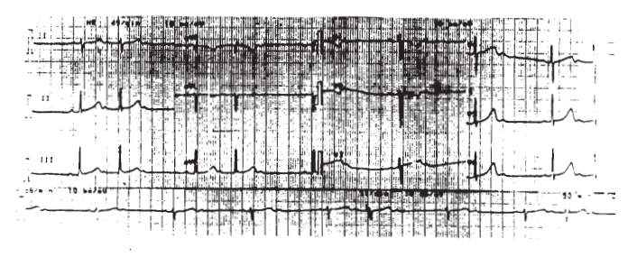
Fig 2–12-lead electrocardiogram of the patient 2 showing Wenckebach and 2:1 AV block on the 9<sup>th</sup> day after the onset of fever.

platelet count 69,000/mm3. A chest radiograph showed normal cardiac shadow and right pleural effusion. On the next day (7th day after onset of fever) the patient's clinical status improved with no fever, stable vital signs (BP 90/50-110/70) and good urine output (3.1 ml/kg/hour). Laboratory investigations showed hematocrit 33%, platelet count 63,000/mm<sup>3</sup>. A dose of furosemide (Lasix) was given for the pleural effusion. On the 8th day of the illness, irregular pulse was noted without any hemodynamic instability. Twelve-lead EKG showed 1<sup>st</sup> and 2<sup>nd</sup> degree AV block. Laboratory investigations at this time showed hematocrit 32%, platelet count 106,000/mm3, serum Na+ 145, K+ 3.4, Cl-110 and total CO<sub>2</sub> 30 meq/l, serum CPK 18 \mu/l , SGOT 111 \mu /l, and LDH = 989 \mu /l. The patient was then referred to Chulalongkorn hospital. There, Wenckebach AV block and 2:1 block was seen without any symptoms or hemodynamic instability (Fig 2). Echocardiogram was normal except for trace aortic and mitral regurgitation. Antibody to dengue virus was positive for IgM and > 1:20,480 for IgG (for dengue virus type 2, no paired serum