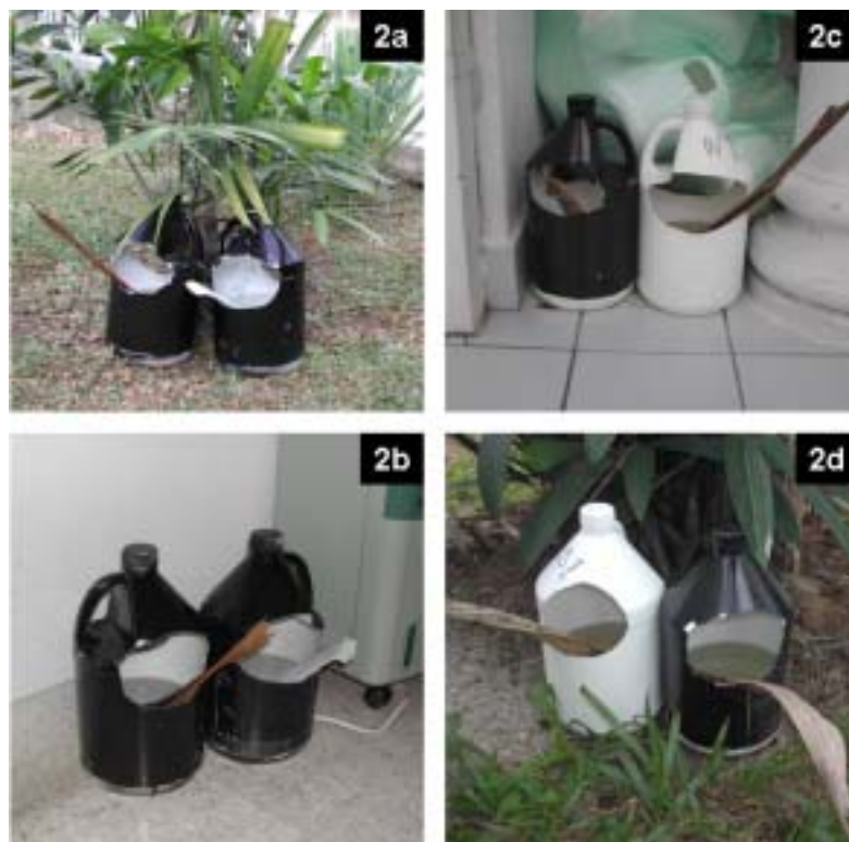
Fig 2—A composite photograph showing respective types of ovitraps used for this field study. Fig 2a and 2b show the type of ovitraps that were respectively placed in the garden (outdoor) and inside the house (indoor) of House 1. Fig 2c and 2d shows the types of ovitraps that were respectively placed in the patio and garden of House 2.

each containing a leaflet of dried Ptychosterma macathurii palm leaves, was placed at each site. For both parts, the process of ovitrapping in the garden was discontinued after completing a certain number of cycles of ovitrapping, while the respective cycles of ovitrapping in the house and patio were continued as usual until the end of the study.