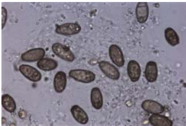
Fig 4—Eggs of Clonorchis sinensis , from the ruptured uterus (x40).