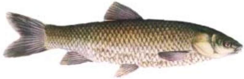
Fig 1–Grass carp, Ctenopharyngodon idellus , freshwater fish, a second intermediate host for Clonorchis sinensis that harbors the encysted metacercariae.

Diagnosis of clonorchiasis is based on the recovery of the characteristic eggs in the feces or in duodenal aspirate (Beaver et al , 1984). The eggs require differentiation from Opisthorchis , another species of liver fluke. The eggs of Opisthorchis closely resembles those of Clonorchis sinensis . Radiologic techniques provide indirect evidence of parasitic infection in the bile ducts. Noninvasive ultra sonography has gradually replaced cholangiography. Computered tomography has also been used in the diagnosis of clonorchiasis (Daniel et al , 1997). Praziquantel is the drug of choice. In the case of heavy infections complicated by obstructive jaundice requiring surgical intervention, cholecystec-