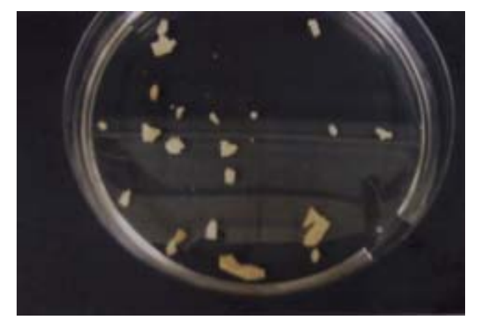
Fig 1–Fragments of gravid proglottids of D. latum.

A 37-year-old Chinese male was seen at the outpatient clinic of University Malaya Specialist Center (UMSC) in August 2004, with a complaint of passing white color flat worm in his stool. He had no other abdominal symptoms. On examination he was not anemic. The rest of his physical examination was normal. The specimen was sent to the Department of Parasitology, Faculty of Medicine, University of Malaya, Kuala Lumpur for identification. The worm passed out in the stool was identified as Diphyllobothrium latum. The diagnosis was confirmed after examination of the gravid proglottids which came out in chains and the typical oval operculated eggs that were expelled after rupturing the gravid proglottids (Figs 2 and 3). The egg measures 71 by 50 µm. The eggs are broadly ovoid, operculate with moderately thick-shelled. The segments or proglottids are greater in breadth than in length. Laboratory investigations showed a hemoglobin level of 13.3 g/l, an eosinophil of 4%, serum vitamin B_{12} of 217 pmol/l and serum folate of 21.4