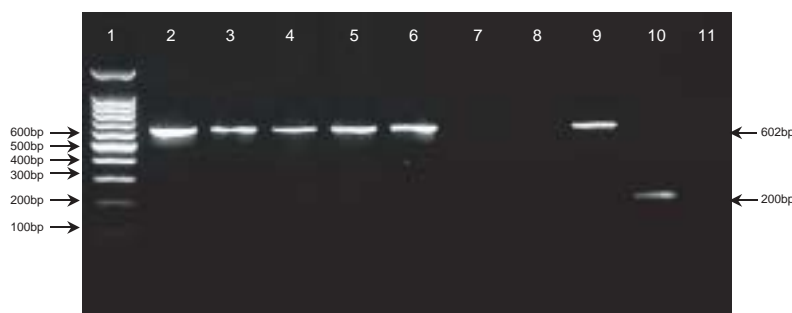
Fig 1—Gel-electrophoresis of PCR product of dengue virus E/NS1 sequence. Lane 1, 100bp DNA ladder; lane 2, isolate DS09/280106; lane 3, DS31/291005; lane 4, DS17/130606; lane 5, DS11/221105; lane 6, DS04/221205; lane 7, negative control; lane 8, prototype DEN-1; lane 9, prototype DEN-2; lane 10, prototype DEN-3; lane 11, prototype DEN-4. PCR amplification of the E/NS1 gene junction gave a 602 base pair fragment. The amplified products were resolved on a 2% agarose gel and stained with ethidium bromide prior to visualization under UV.

Alignments of the nucleotide and deduced amino acid sequences of the five Brunei DEN-2 isolates at the E/NS1 gene junction are shown in Fig 2. Differences occurred at 7 positions (2.9%) of the sequenced region. Isolate DS04/221205 showed 100% identity with isolate DS31/291005. Isolates DS09/280106 and DS17/130606 had 4 nucleotide substitution (A→G at position 2376 and 2385, C→U at position 2442 and G→A at position 2496), whereas 6 substitutions were found in isolate DS11/221105 (G→U at position 2320, A→G at position 2376, 2379 and 2385, C→U at position 2442 and A→U at position 2487). The substitutions were generally located at the