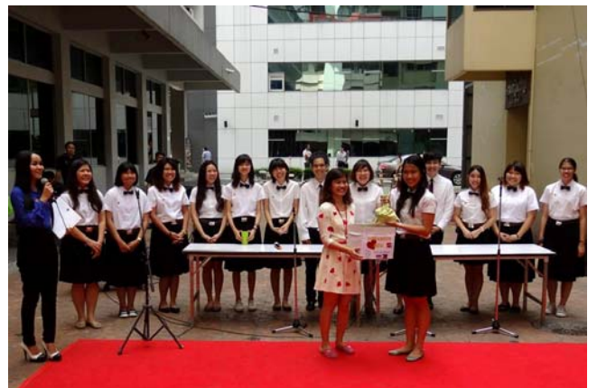
Donation of 15,400 bahts from "Khun Kru's Choir"