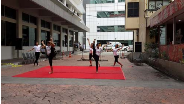
Rhythmic Sportive Gymnastic By College of Sports Science and Technology, MU