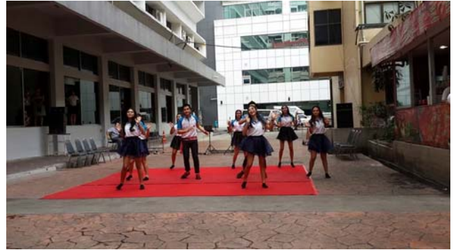
Dance from the Heart Together with our Support and Spirit By Practical Nurse Students, FTM