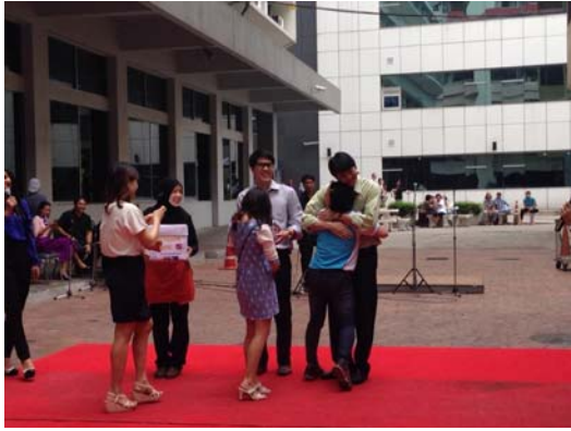
Hug for the Philippines