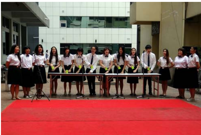
Chorus Band "Khun Kru's Choir" By Student Volunteer Band, MU