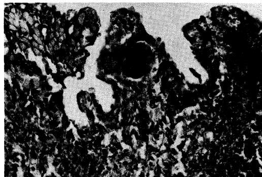
Fig 3—Early sporocyst in the head-foot tissue of Yunnan snail on infection with miracidia of Anhui isolate of S. japonicum 2 days after exposure. x400

southwest infected with miracidia from east China (Shao et al , 1957; Yuan, 1958). According to the snail sections examined, early sporocysts could be found in the tissue of head-foot region of the snails from Yunnan with an infection with Hubei or Anhui parasites two days after exposure (Fig 3). This demonstrated that although the miracidia from Hubei or Anhui can penetrate into the snails from Yunnan or Sichuan, cercarial stages were found rarely in these snail hosts or no developmental stages of parasite were found. In contrast to these results, the isolates from Sichuan and Yunnan were able to develop in Oncomelania snails from Hubei and Anhui, resulting in infection rates of 10.2% and 7.0%, or 44.5% and 13.4% respectively.