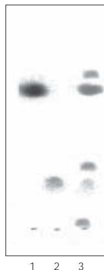
1 = AS1, 2 = AS2, 3 = hexane crude extract.

The triglyceride with one oleate ester in coconut oil (1:1) was significantly more active against head lice than gamma benzene hexachloride 1% cream and the hexane crude extract. These data are supported by previous reports (Gritsanapan et al , 1996; Tiangda et al .