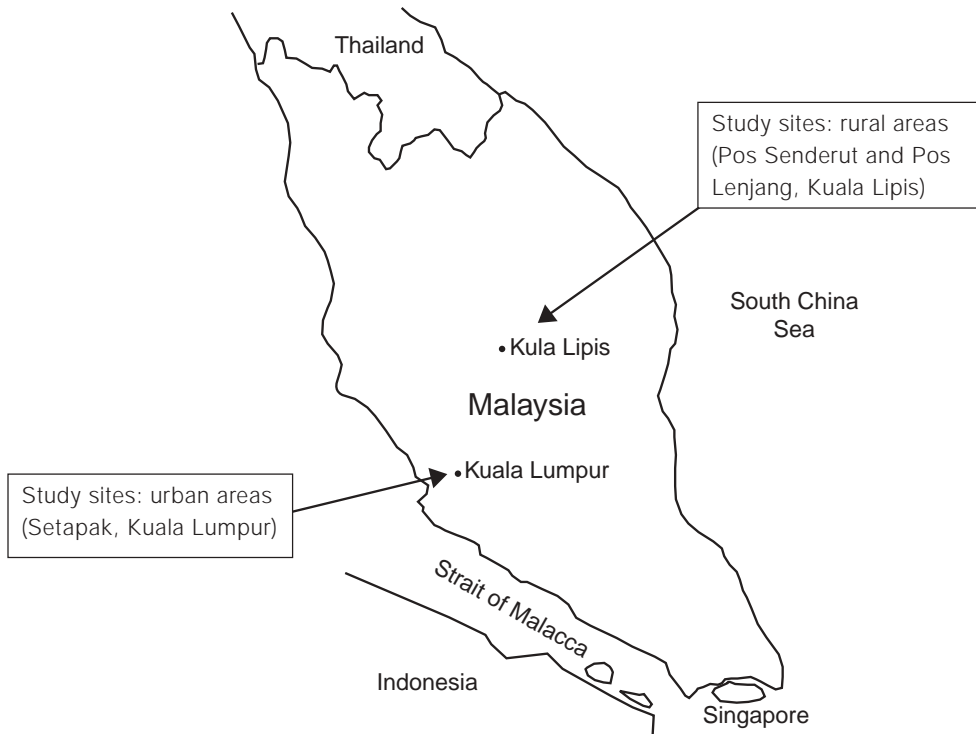
Fig 1–Map of Peninsular Malaysia showing urban and rural study sites.

2,000 rpm. SAF solution was added to make up a volume of 10 ml. Three milliliters of ether was added to the suspension and mixed by shaking vigorously for 1 to 2 minutes. The mixture was then centrifuged for 5 minutes at 2,000 rpm. The supernatant was discarded and the pellet was mixed and a drop of the suspension was then transferred onto a glass slide and covered with a cover-slip and examined under 10x and 40x objectives under the microscope.