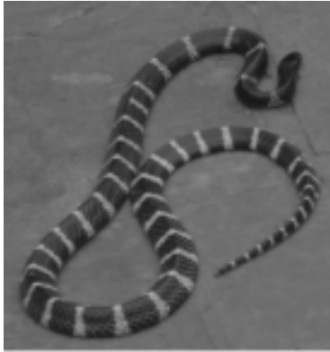
Fig 1– Bungarus multicinctus .