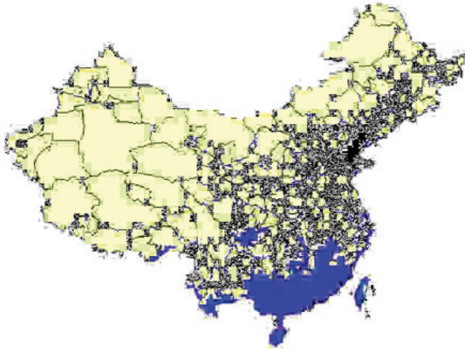
Fig 1—The putative range of Aedes aegypti in China predicted by GARP. The putative range of Aedes aegypti includes Hainan, Guangdong, Guangxi, part of the border areas of south-eastern Tibet, western and southern border areas of Yunnan, parts of southern Guizhou, southern Hunan, areas adjacent to Chongqing City, and parts of Jiangxi and Fujian.

therein. Larvae were reared individually in a laboratory, and associated larval and pupal skins were mounted. All specimens were identified using standard taxonomic keys.